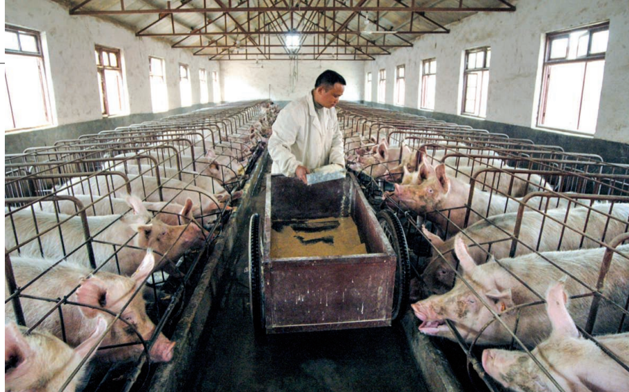
Antibiotics have been found in pork in China.